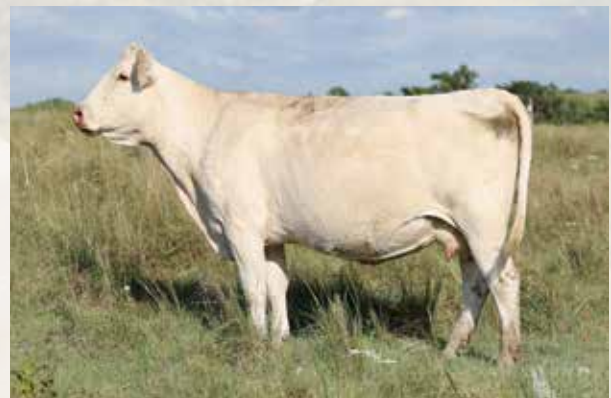
VFR REAGAN 7R08 PLD - DAM OF LOT 1