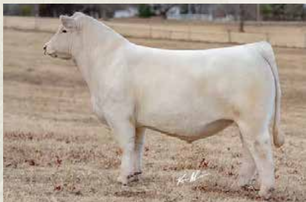
WIA BLACKWATER JACK 060P - SIRE OF LOT 18

Here is one that gets Terrill excited. An outcross pedigree that stems back to the popular AI sire Backwater Jack. Loaded with style, muscle shape and a square hip. Strong carcass and maternal traits make him a viable option for any operation.