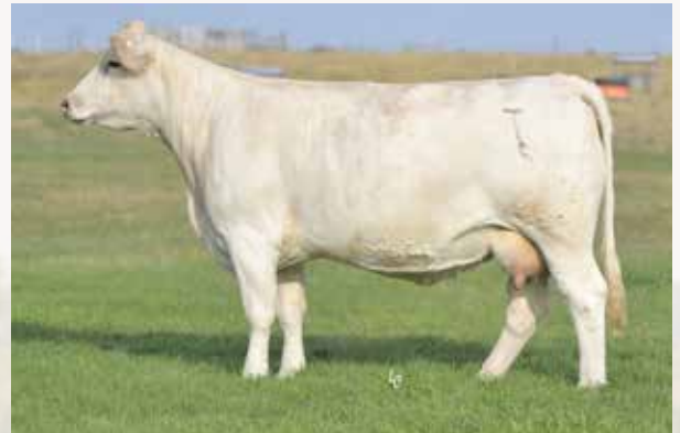
TS MISS SWIMMING THE POND - DAM OF LOTS 8, 10, 11 AND 12

Full brothers sell as lots 11 and 12 and a maternal brother to lot 8.